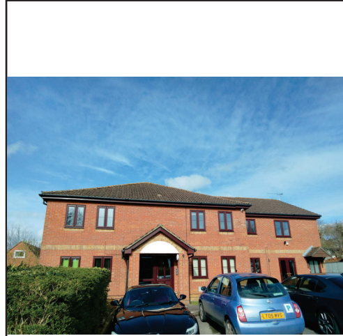
Roofing (Tiles and Cladding)