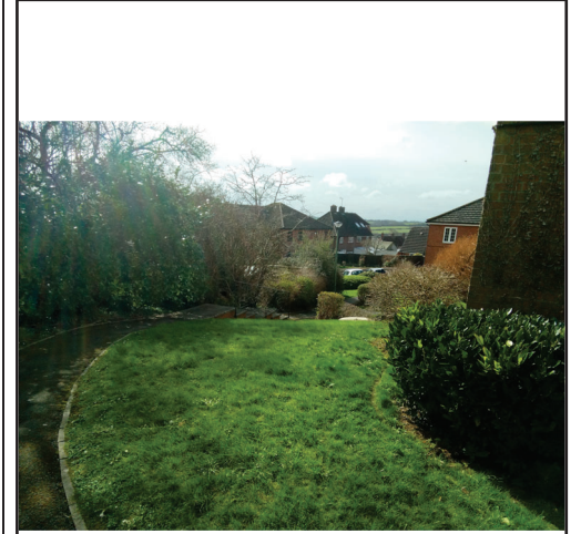
Communal Grounds (Gardens and Common Areas)