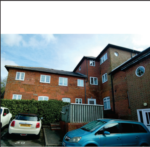
Exterior Structure (The Building)