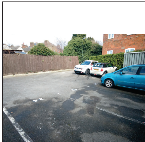
Car Park (Vehicle Parking)