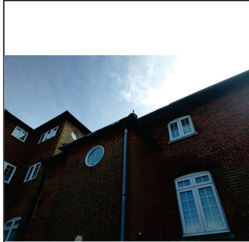
Guttering (Gutters and Fascia)