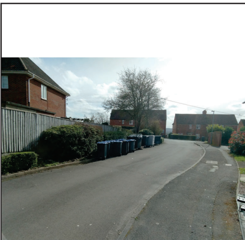
Bin Store (Waste Disposal Area)